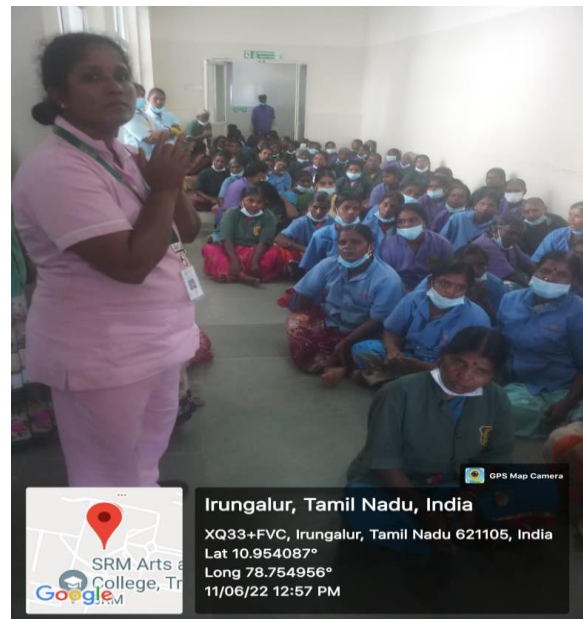
HOUSE KEEPING ,ATTENDERS