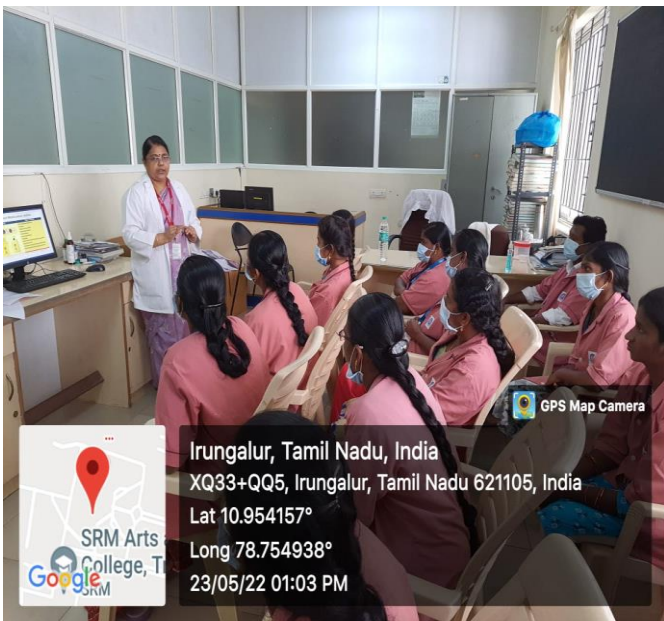
BMWM –LAB TECHNICIANS